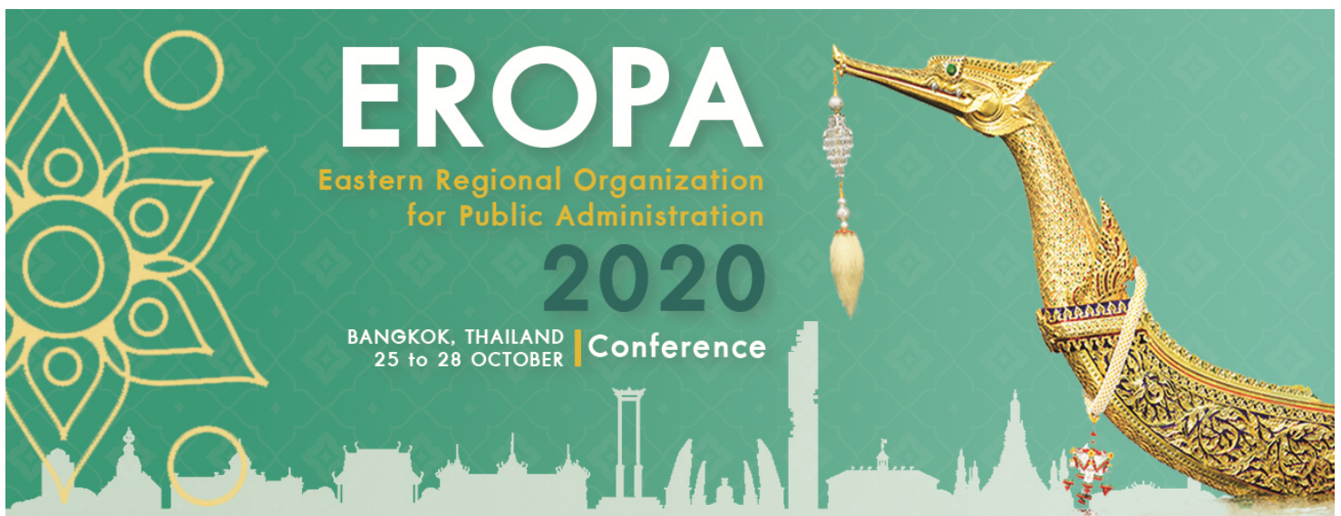
The official marketing header of the 2020 EROPA Conference