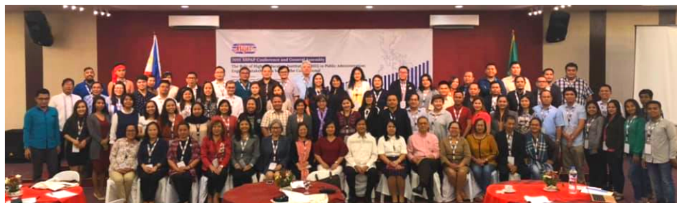
A group photo of all the conference participants of the 2019 ASPAP Conference.