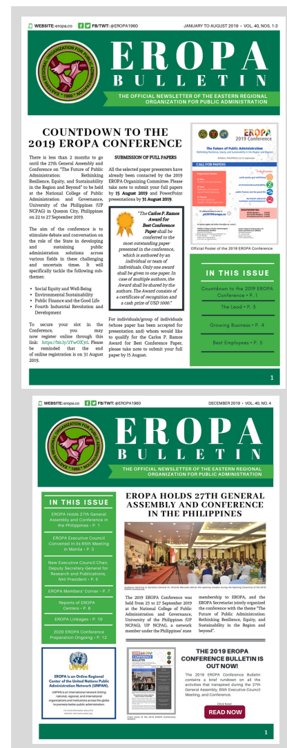
Cover Pages of the Last 2 Published Issues of the EROPA Bulletin

Please send your contribution(s) to publications@eropa.co , no later than 30 MARCH 2020, MONDAY – for it to be considered for the next EROPA Bulletin. Contributors will be informed accordingly upon receipt and approval of contribution.