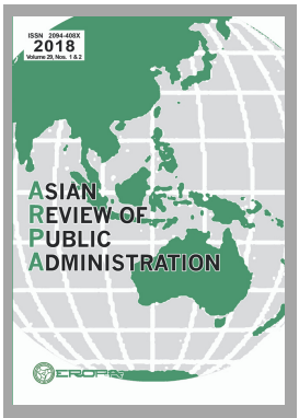
The front cover of ARPA Vol. 29, 2018 Issue - Nos. 1-2

Since ARPA is essentially a regional journal, priority will be given to manuscripts focusing on issues and developments relevant to Asia and the Pacific region. Articles submitted for publication should be between 6,000 and 8,000 words inclusive of notes and references. They should be submitted double-spaced, preferably online, to publications@eropa.co or http://journals.sfu.ca/arpa/index.php/arpa/announcement . ■