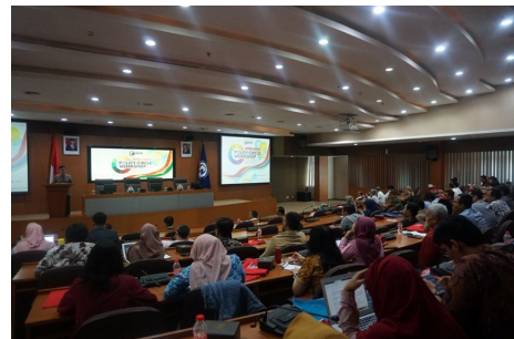
Top: Group photo of the workshop presenters; Bottom: Audience of the International Policy Cycle Workshop