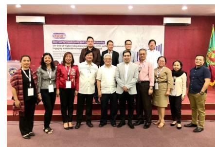
Top: Official Poster of the 2019 ASPAP Conference; Bottom: A group photo of the set of newly elected officers of ASPAP Officers and Board of Directors

Association of Schools of Public Administration in the Philippines