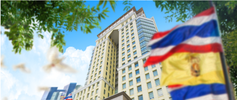
Photo of the International College of NIDA

The “Asian Review of Public Administration” (ARPA) will consider quality papers on important and internationally relevant developments on public administration in the Asia-Pacific region. Paper presenters who wish to have their papers considered for publication in the journal must adhere to the journal style guidelines set forth by the ARPA Editorial Board. Please visit https://www. eropa.co/arpa.html to know more about ARPA, and refer to https://www.eropa. co/notes-for-contributors.html for the guidelines.