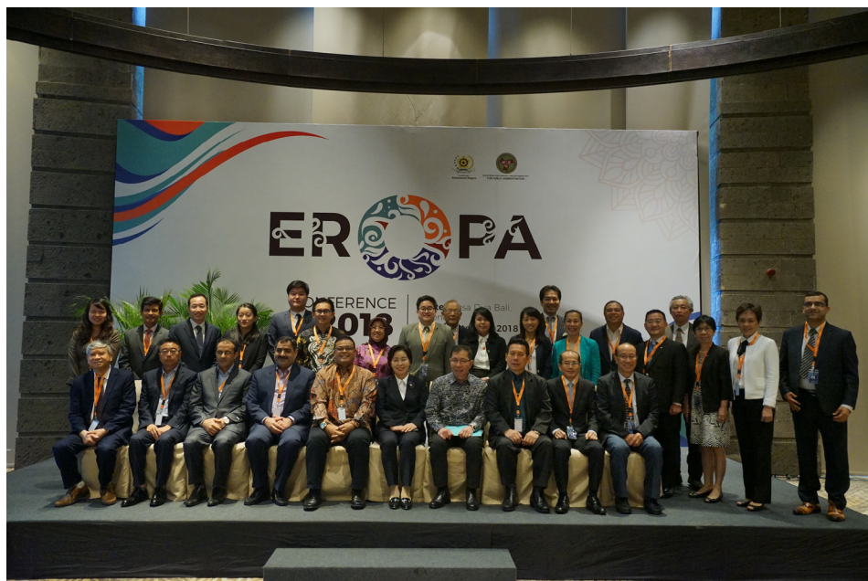
EROPA's Executive Council Members pose for a group photo.

Officials and members of the Executive Council of the Eastern Regional Organization for Public Administration (EROPA) gathered at the Sofitel Nusa Dua Bali in Bali, Indonesia on the afternoon of 16 September 2018 in its 64th meeting to discuss pertinent issues related