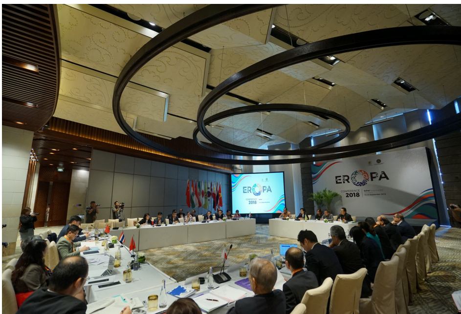
Members of the EROPA Executive Council discuss administrative issues and other concerns of the organization during its 64th meeting in Bali, Indonesia.