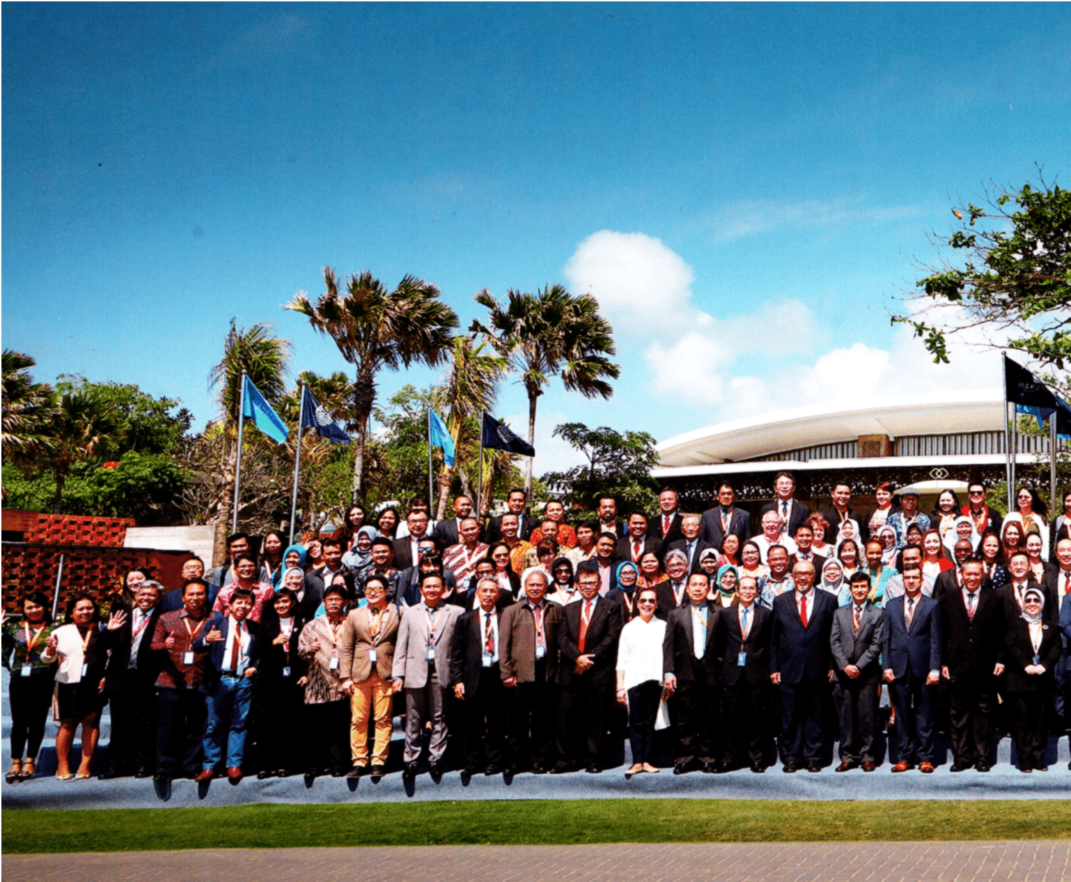
Participants of the 2018 EROPA Conference pose for a group photo.