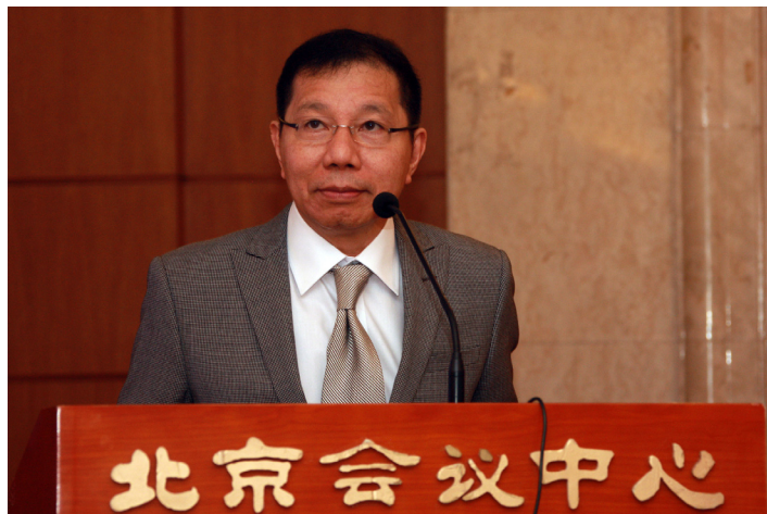
EROPA Secretary General Orlando S. Mercado addresses the seminar participants during the Opening Ceremony of the International Seminar on E-Governance in Asia.