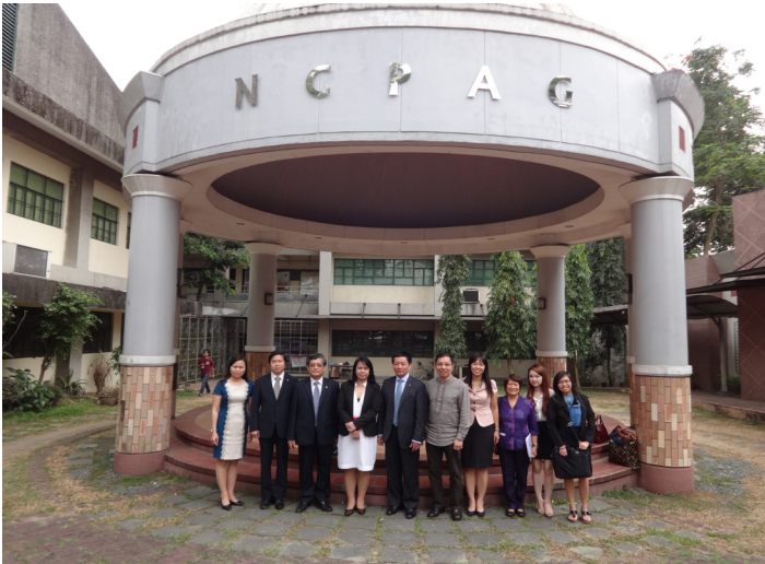
EROPA and NAPA officials and staff pose under the NCPAG Dome after a short meeting on conference preparations.