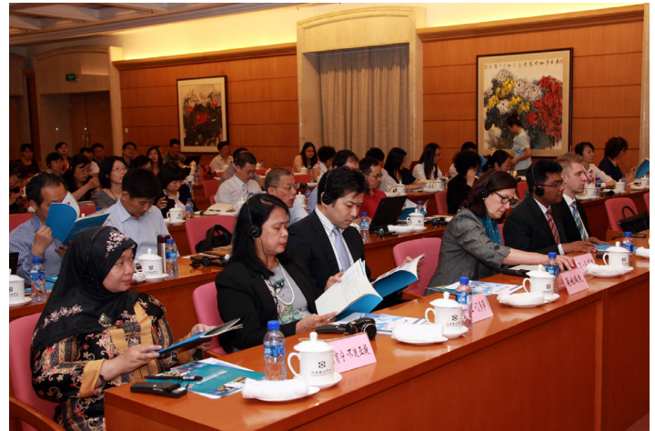
Seminar participants engaged in discussions on two different sub-themes: trends, approaches and impacts on e-government practices; and the use of social media to engage citizens in governance.